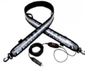
Flexible LED Camping Light was $99 NOW $70