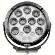
Great Whites Attack 220mm Round Driving Light $589