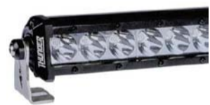
THUNDER 18 LED Driving Light Bar $241